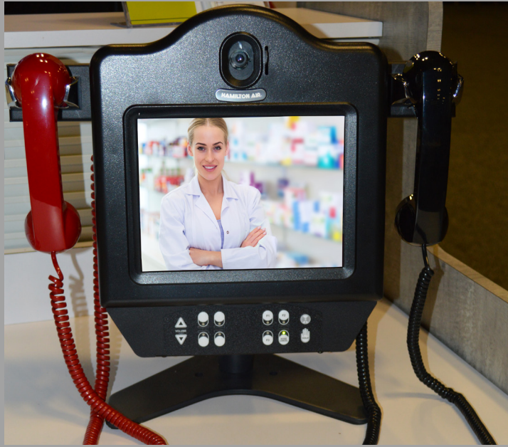
DUAL LANE PHARMACIST UNIT

The Hamilton Pharmacy Audio and Video offerings are designed with the highest clarity to make the drive-thru experience personal and easy as possible, for both customer and pharmacist.